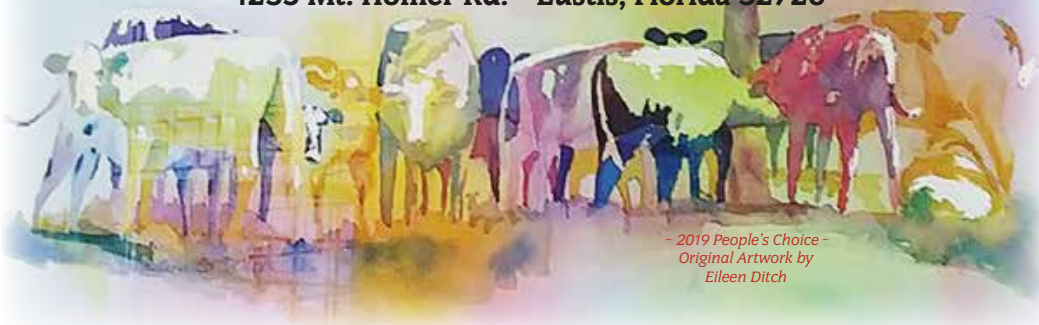
- 2019 People's Choice - Original Artwork by Eileen Ditch

Unitarian Universalist Congregation Building 1235 Mt. Homer Rd. • Eustis, Florida 32726